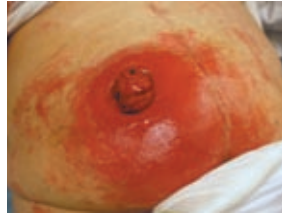
September 16, 2008 : Peri-stomal skin irritation.

The knowledge of an ET nurse is prevalent in choosing an appropriate ostomy system, because some leaks may occur due to the use of inadequate systems. Peri-stoma leaks can have serious consequences for the patients;