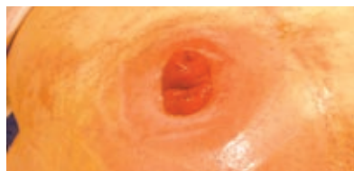
September 19, 2008: The healing of the peri-stomal skin irritation.

Once the skin was protected from the effluent, we observed a significant healing of the peri-stomal irritation within 3 days.