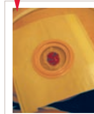
September 16, 2008

5- To obtain a large adherence surface, a hydrocolloid film was applied over the skin barrier.